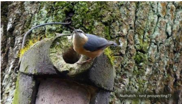
Nuthatch - nest prospecting??