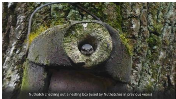
Nuthatch checking out a nesting box (used by Nuthatches in previous years)