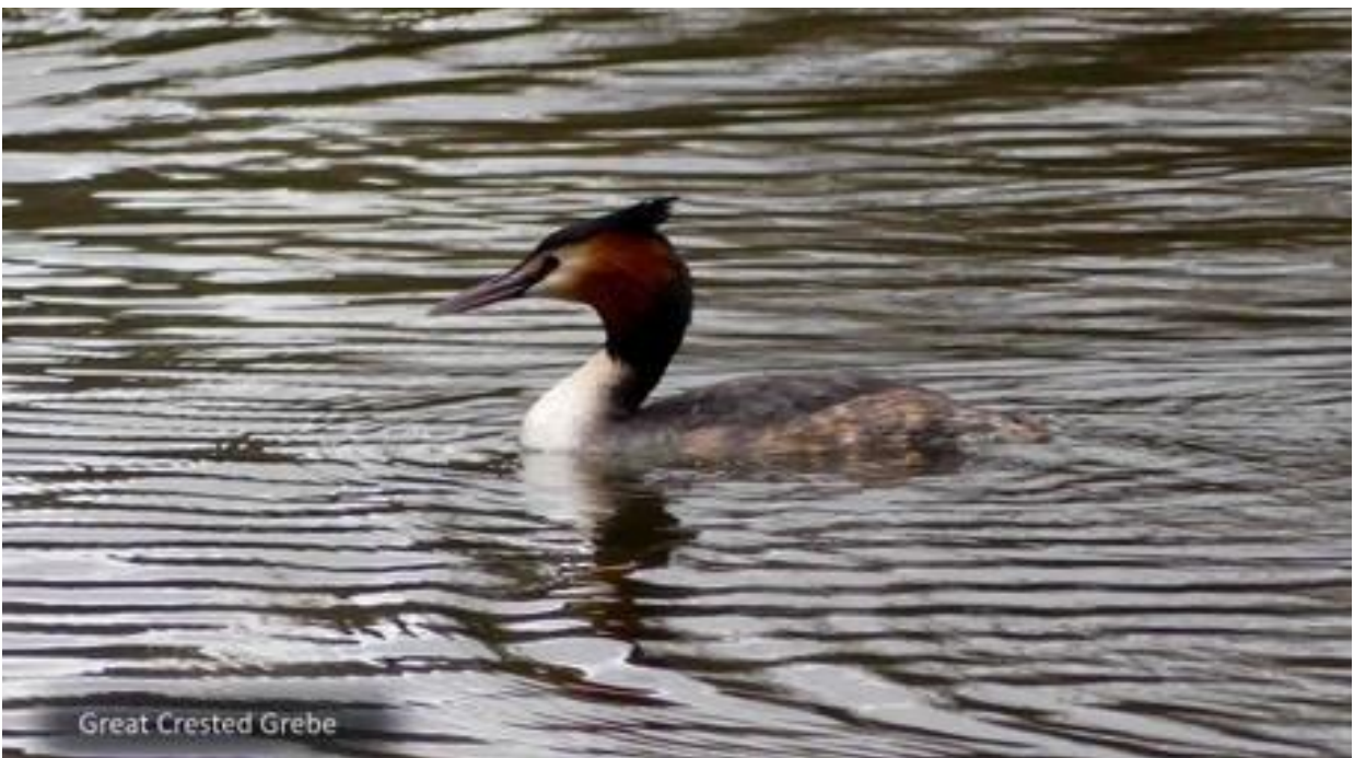
Great Crested Grebe