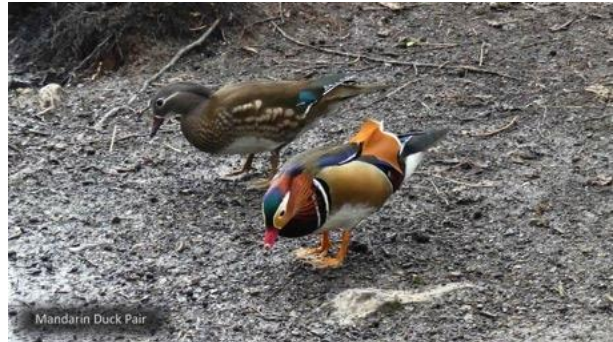
Mandarin Duck Pair