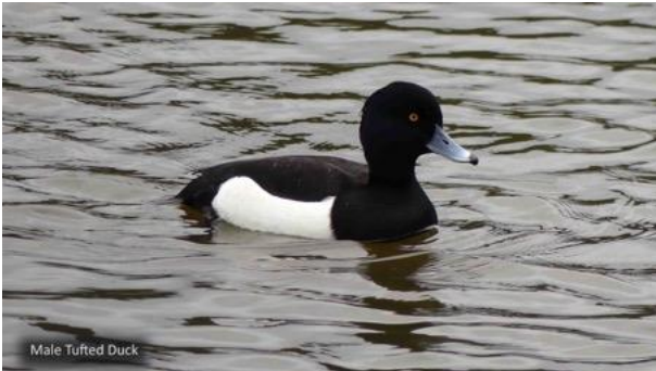
Male Tufted Duck