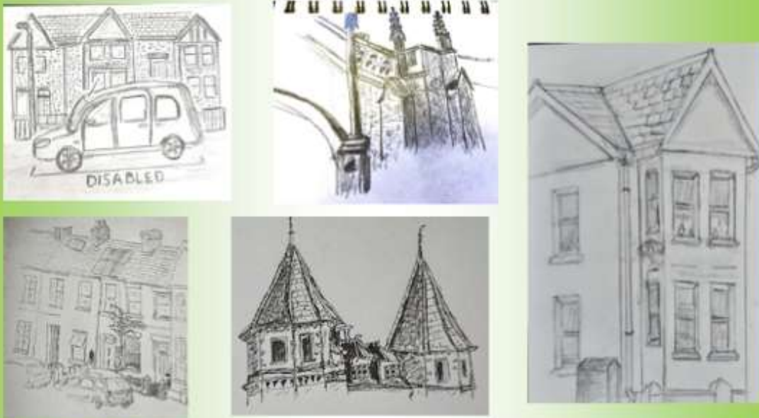
Selection of Sketches from previous meetings.

I would like to recommend to U3A members if you have not made a visit to The Exmouth Museum. It is be well worth your time.