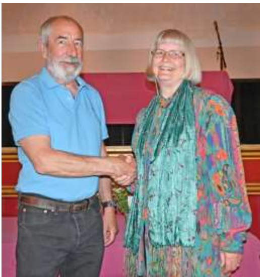
Outgoing Chair welcoming New Chair